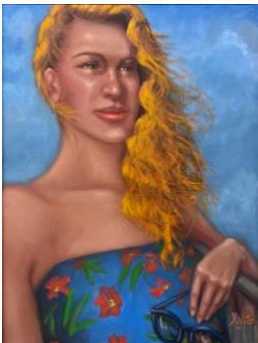
Pelirroja (Redhead) Oil on Canvas 12 x 16 in 1700.00 USD

Pelirroja uses some of the brightest colors in my palette. The cerulean blue and cadmium red as well as an array of orange pigments all spell summer to me, though the model herself was nowhere near a beach.