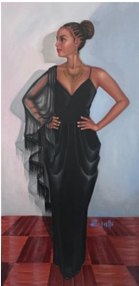
Madame X-ish Oil on Canvas 24 x 48 in 20,500.00 USD