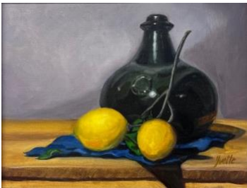
Dusty Wine Bottle with Lemons