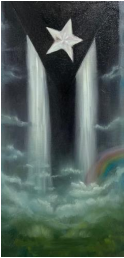
Puerto Rican Flag in B&W