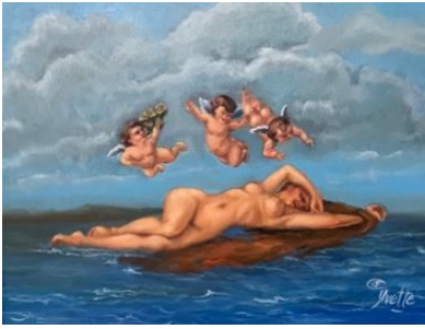
Birth of Venus in The Bronx Oil on Canvas board 12 x 16 in 1700.00 USD

There are many depictions of "Birth of Venus". This was inspired by Cabanel's two versions, one of which is in NYC and the other in Florence. The sense of realism alongside fantasy in his paintings is convincing and beautiful.