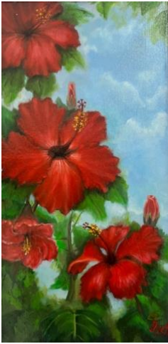
Flor de Maga (Hibiscus)