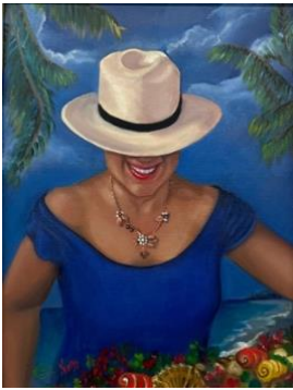
Cuba Hat Oil on canvas 12 x 16 in 1700.00 USD