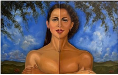
Abrazando a Eva Oil on Canvases 32 x 20 in (diptych) 12,500.00 USD

Abrazando a Eva consists of two canvases side-by-side. The two halves show a woman who represents Puerto Rico. Her features on each half are as identical as I could paint them, with two exceptions: her hair and her skin color. Her arms are crossed in front of her, and with that I am saying, "embrace your differences."