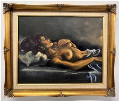
Woman in Repose Oil on canvas 16 x 20 in 2200.00 USD

There are many depictions of "Birth of Venus". This was inspired by Cabanel's two versions, one of which is in NYC and the other in Florence. The sense of realism alongside fantasy in his paintings is convincing and beautiful.