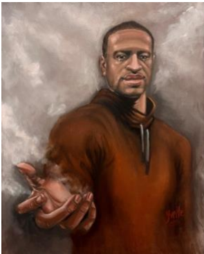
Mr. George Floyd

Also painted after Hurricane María hit Puerto Rico, this is a stark reminder of the thousands of people who lost their lives in the wake of that cataclysmic event. The rainbow and greenery peeking through at the bottom of the painting reflects hope and rebirth.