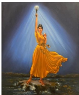
Flaming Truth Oil on Canvas 20 x 24 in 5200.00 USD

Confident, forward-moving, and serene, Madam X-ish was inspired by John Singer Sargent's "Madam X" (which created a stir in its time!) and a photo of my daughter-in-law.