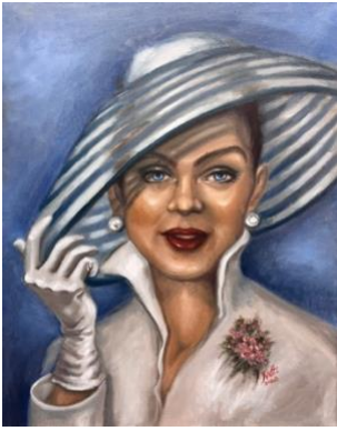
Blue Eyes Oil on canvas 16 x 20 in 1200.00 USD