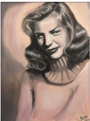
Lauren Bacall Oil on canvas 12 x 16 in 1700.00 USD