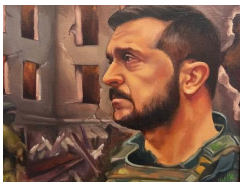
Ukrainian Gladiator Oil on Canvas board 11 x 14 in Silent Auction, begins at 3200.00 USD

Flaming Truth is the 2nd in the series of "Flaming" paintings, which depict women who embody hope and perseverance, and who inspires through her actions or presence.