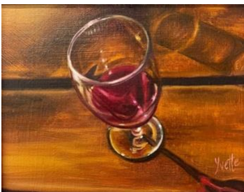
Kiss of Wine

The original bottle, described to me as an "olive jar", possibly dates to 1726. The dust is of more recent vintage, according to the owner! As I paint glass, I constantly go back and forth between seeing the object itself and then the effects of light on that object. It is like seeing an object with two different sets of glasses.