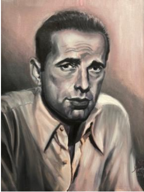
Humphrey Bogart Oil on canvas 12 x 16 in 1700.00 USD

Yvette Armstrong Art As Strength | El Arte Es Fuerza