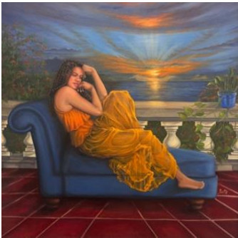
Flaming July Oil on Canvas 36 x 36 in Not For Sale

Abrazando a Eva consists of two canvases side-by-side. The two halves show a woman who represents Puerto Rico. Her features on each half are as identical as I could paint them, with two exceptions: her hair and her skin color. Her arms are crossed in front of her, and with that I am saying, "embrace your differences."